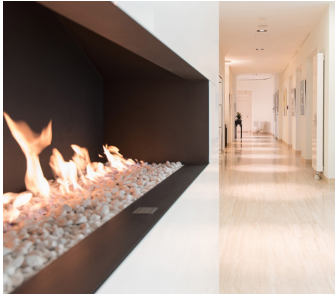
Beschnidt Dental Practice